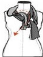
4. Pull second side over and through loop.