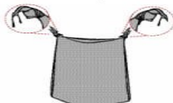
3. Open scarf into a ring-shaped circle.