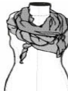
8. Pull one knotted end up between neck and material.