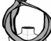
4. Put scarf over the head with knotted ends in back.