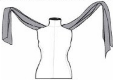
1. Drape scarf behind neck.

Double Wrap: Use a solid scarf with bold prints.