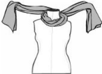
3. Wind around back of neck and wrap back around shoulders.