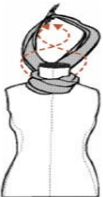
5. Twist scarf in back of neck.