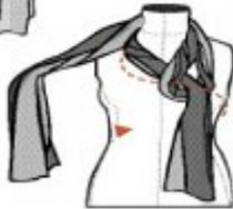
3. Pull one side under & through loop.