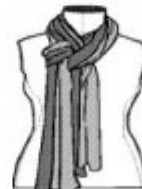
5. Tighten & fluff.