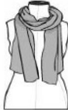
4. Fluff neckline.