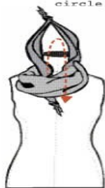
7. Pull neck material out away from neck.