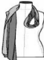
2. Drape around neck with looped end on one shoulder.