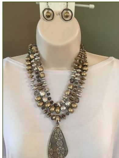
RICH & FAMOUS pendant on GOLD MINE N.