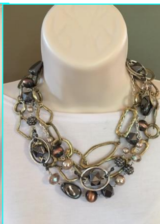
Doubled with TOTAL ECLIPSE N.