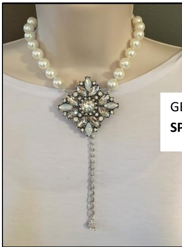
GBF pearls with SPECTACULAR pin.