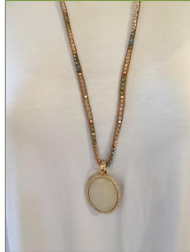
POP of POSH with reverse side of AVERY pendant. (Could also add SECOND ACT pendant)