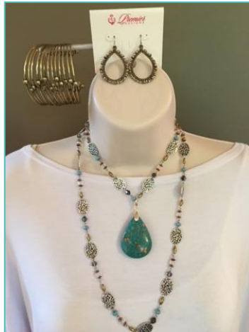
RUSTIC DIVA pendant on WILLOW