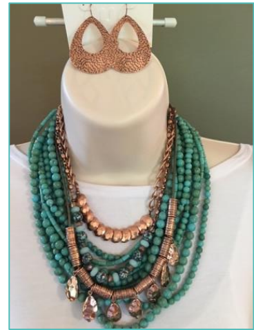
PRESLEY N layered with ACAPULCO and COPPER MOON E