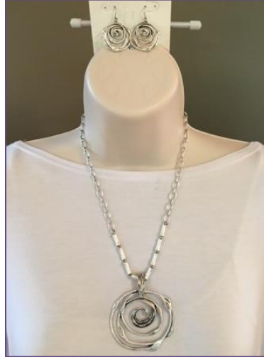
Use as a foundation necklace. Add SILVER SWIRL .