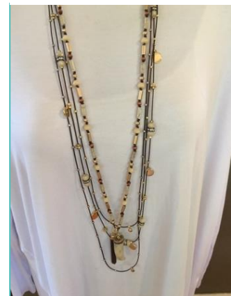
Layer with RUSTIC DIVA