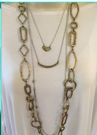
HOOP HOOP HOORAY layers with DOWN TO EARTH .