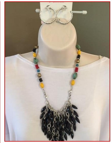
-Can attach TRIPLET