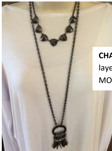
CHA CHA CHA N layered with black MONTANA strands.