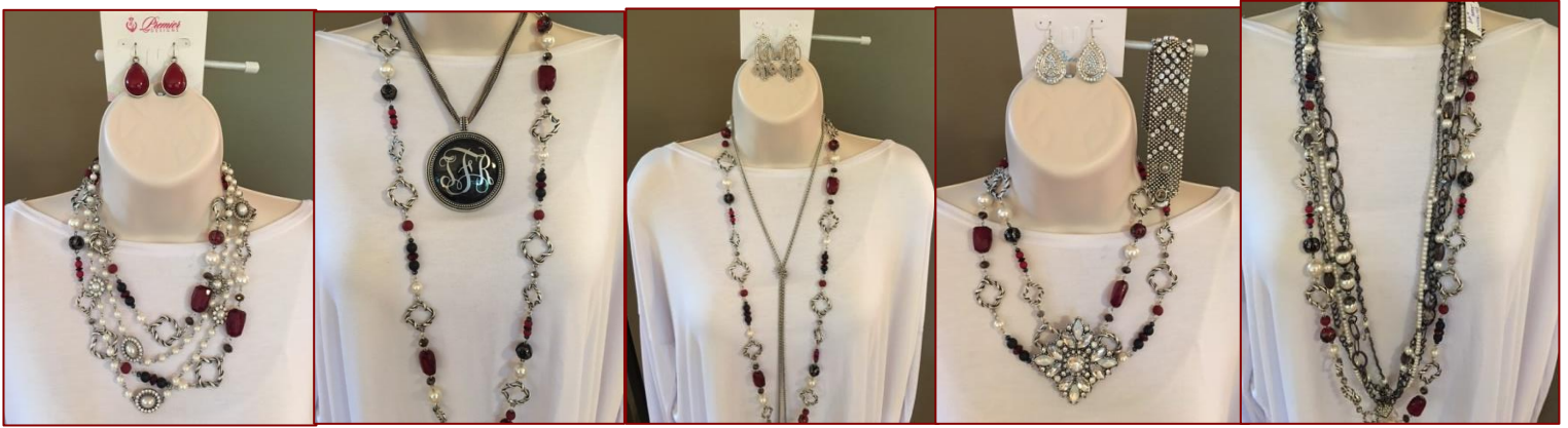
BORDEAUX N doubled with PRIMM N and CAYENNE E. Frame your CELESTE N. (those are vinyls added for initials) BORDEAUX layered with TASSEL , BORDEAUX butterflied with CAPTIVATING , or layered with LAYERED ON