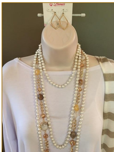
HARPER N layered with OPENING NIGHT and GOLD ESSENCE E.