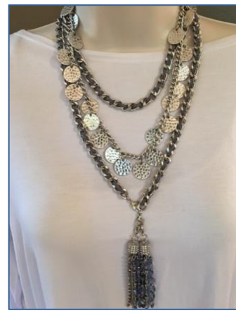
-Add the coins from SUGAR RUSH