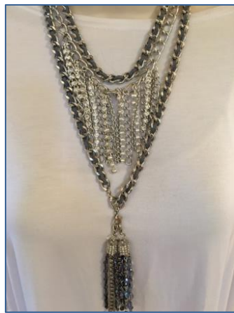
-Add fringe from GBF