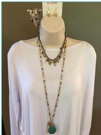
RUSTIC DIVA – layered with CAMILLE N, URWAY E & SHELBY B