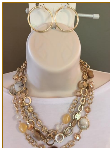
RIVIERA and HARPER doubled.