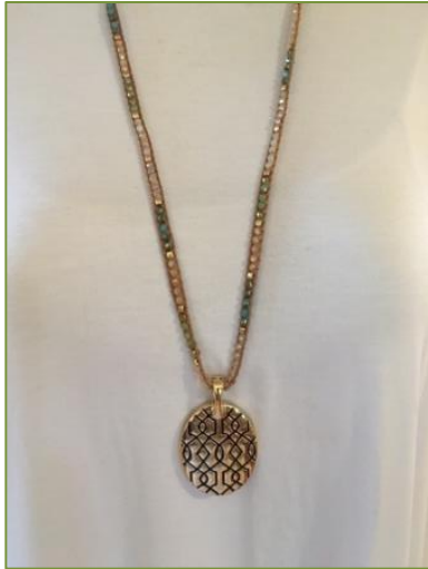
POP OF POSH with AVERY pendant