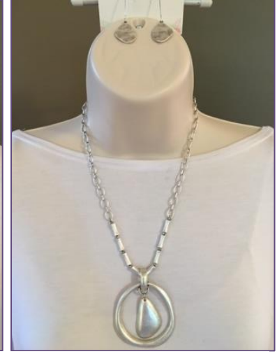
Add EASY LIVING