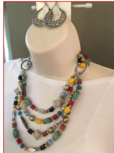
-Can also use the detachable beads to shorten or lengthen