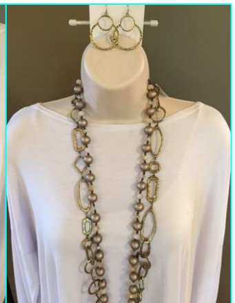
Layered with LUSTER N.