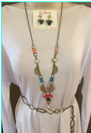
POP ART Necklace stands alone. Add HOOP HOOP HOORAY as a belt.