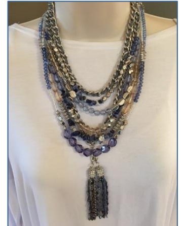
-Layer with LEXI