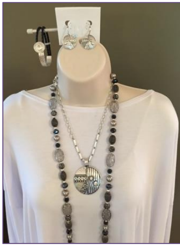
NEW SEASONS framed with NYC