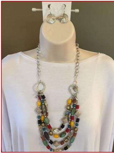
HERE COMES THE SUN -Extend with GIRLS BEST FRIEND Silver N