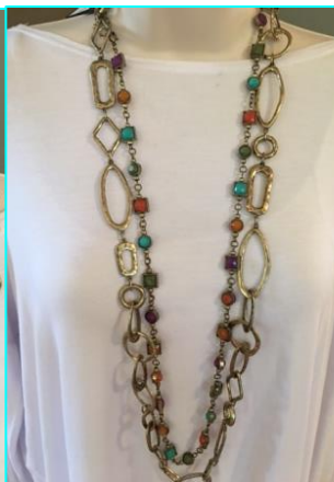
Layered with CHICLET N.