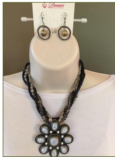
Add POSY onto RICH & FAMOUS strand.