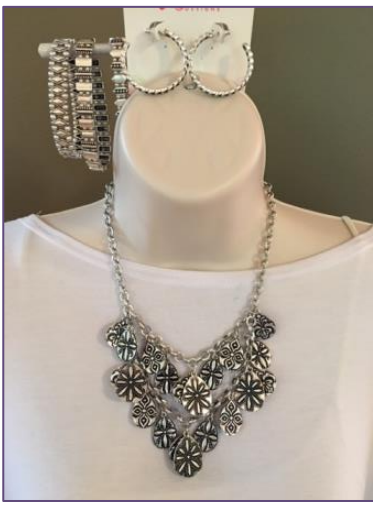
VIOLET reversed is fantastic!