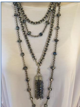
-Add HEAVEN SENT