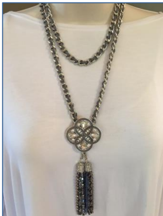
DUSK Necklace -Add GBF pin