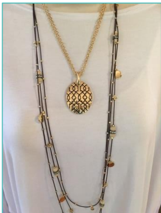
VINTAGE VIBE and AVERY N (either side)